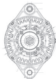
J180 Mount, Mounting ears at 6:00 and 12:00